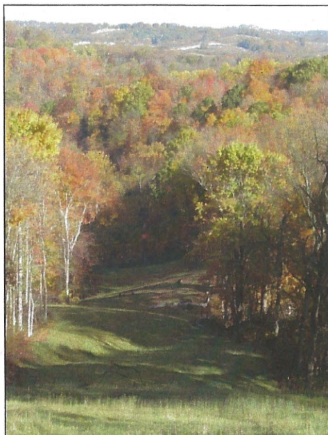
Example of a restored right-of-way on the Appalachian Gateway Project in Pennsylvania

While we believe that the Internet is the best way to stay informed of the Project, we realize that not everyone has Internet access. From this point forward, issuances by the FERC environmental staff, including the draft and final EIS, will be mailed to all interested parties on the environmental mailing list in either hard copy or compact disc format.