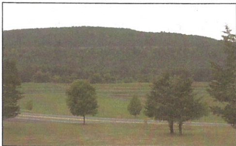
View of agricultural land in Schoharie County, NY

The comments we've received so far have helped the environmental staff identify and begin evaluation of the potential impacts of the proposed project. Please stay involved and consider filing comments on the draft EIS when it is available. Your comments will help ensure that the final EIS is comprehensive.