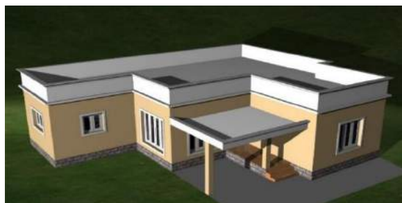
✓ Flat Roof with a Continuous Parapet