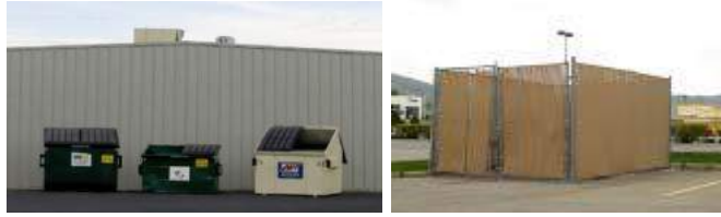
X Unscreened Ground Level Equipment