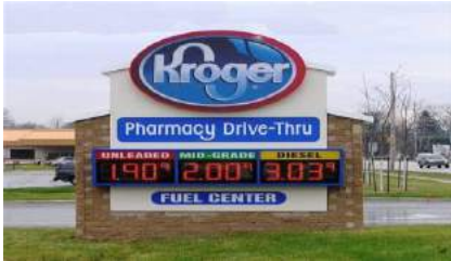
✓ Gasoline Monument Sign