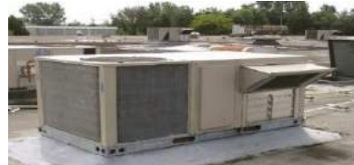
X Unscreened Rooftop Equipment