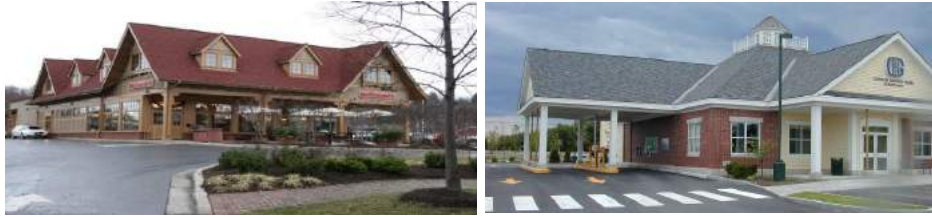
✓ Drive-Through Design that Responds to Character of the Neighborhood