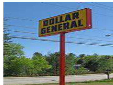
X Freestanding Single-Pole Signage Internally Illuminated