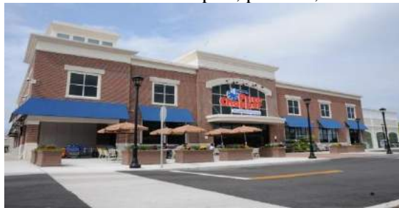
✓ Facade with Recess and Projections