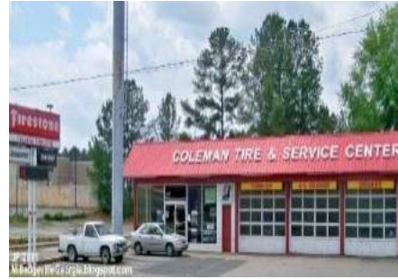
X Service Bays & Parking along Primary Street