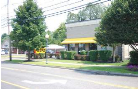
✓ Service Bays & Parking along the Side of Buildings