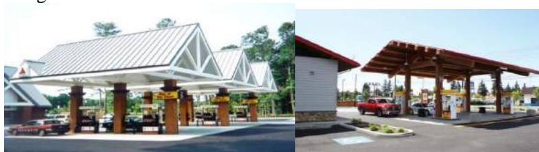
✓ Recommended Gasoline Station Canopy

See Article IX, Site Plan Review application requirements. Lighting plans shall be included in Site Plan Review. Lighting plans submitted for review and approval for Subdivision and land development and Site Plan Review shall include a layout of the proposed fixture locations, and typical specifications for the fixtures. The Planning Board may also request foot-candle data that demonstrate conforming intensities and uniformities; and a description of the equipment, glare control devices, lamps mounting heights and means, hours of operations, maintenance methods proposed, and illumination intensities plotted on a ten (10) foot by ten (10) foot grid.