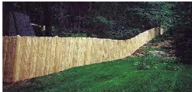
X Fence with No Visual Breaks