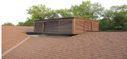
✓ Screened Rooftop Equipment