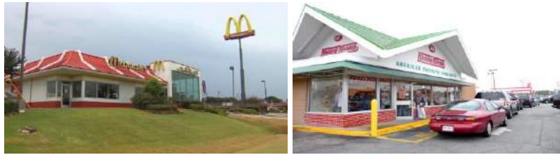
X Drive-Through Design that Does Not Respond to the Character of the Neighborhood