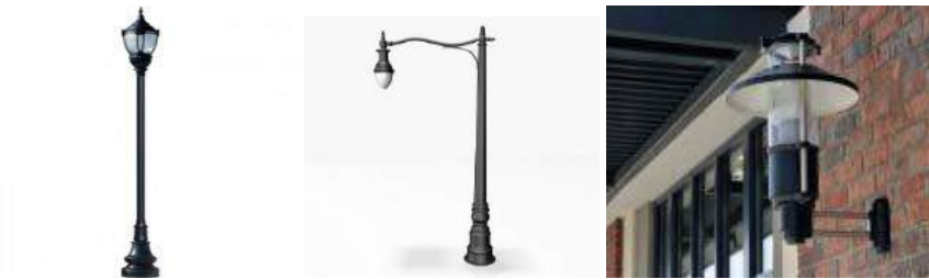
✓ Appropriate Lighting Which Adds Visual Interest and Highlights Aspects of the Building