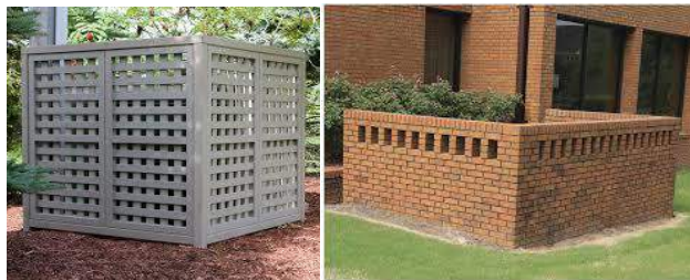
✓ Screened Ground Level Equipment