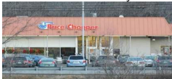
X Facade without Recesses and Projections