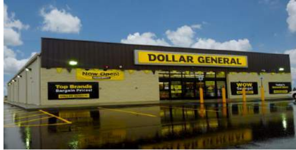
X Non-Continuous False Front Roof