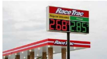
X Single Pole Signage with different color price lighting