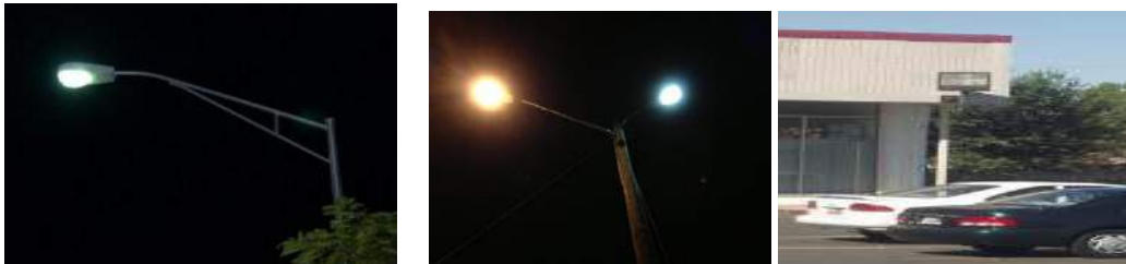
X Inappropriate Lighting Which Creates Glare onto Adjacent Streets and Properties