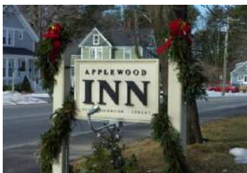
✓ Freestanding Two-Pole Signage Externally Illuminated