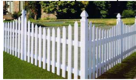
✓ Fence and Columns with Decorative Caps