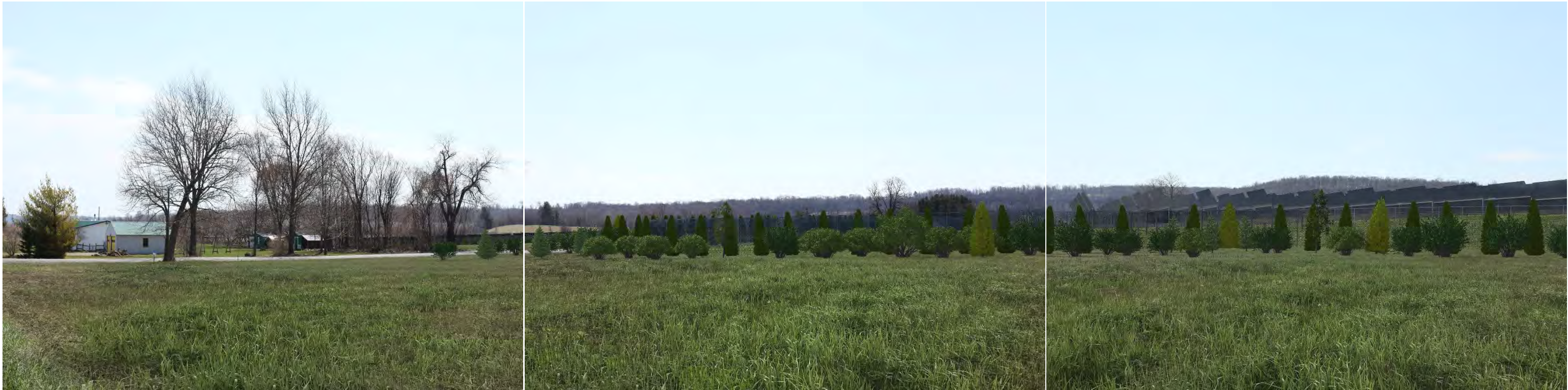
Landscaping at 5 Years