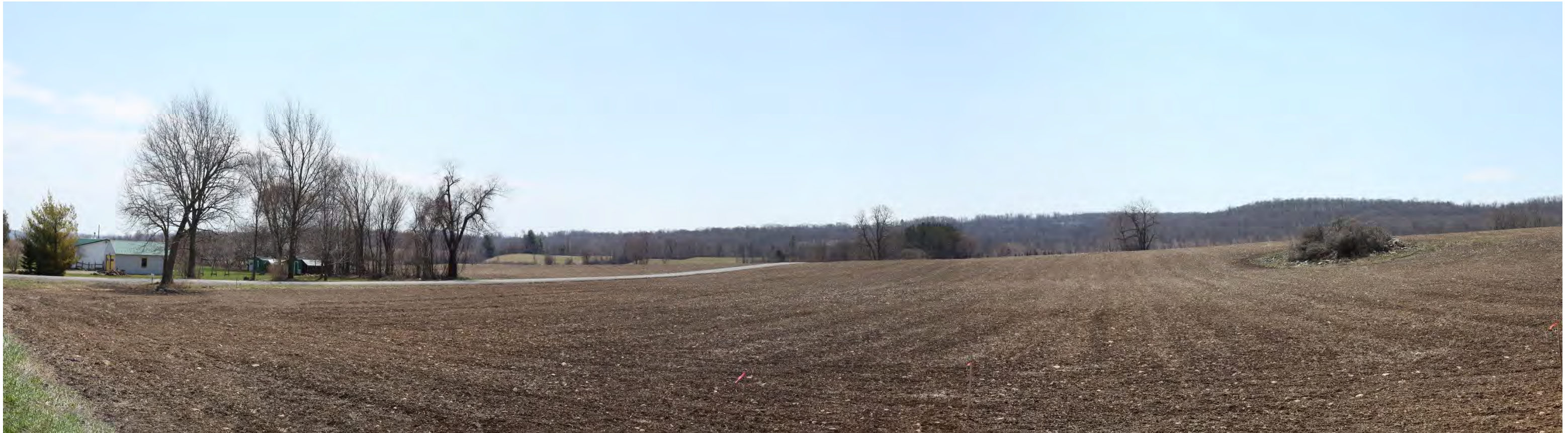
Landscape Mitigation at Planting Time