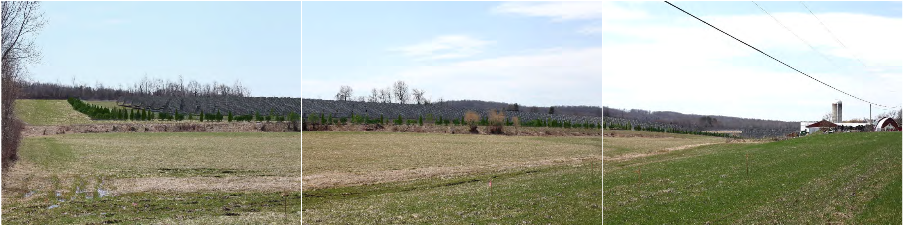
Landscaping at 5 Years