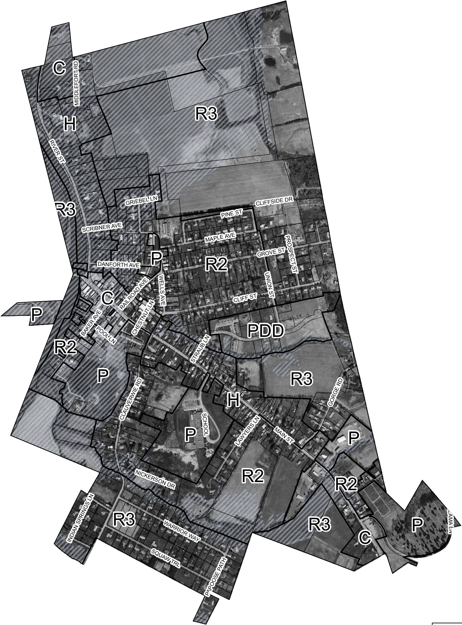
Map 2 of 2 March 2, 2009